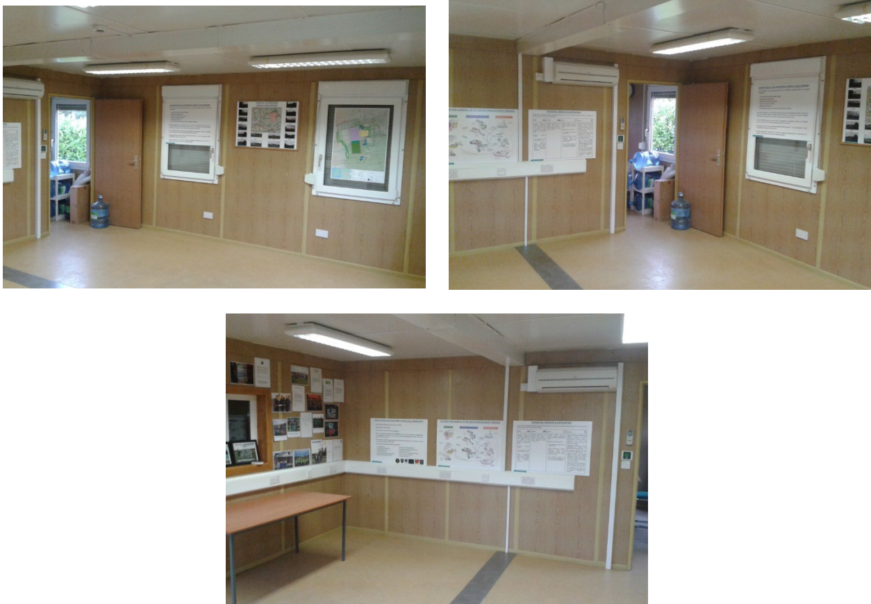
Figure 5-1: Story Boards presented at Public Information Event

A total of 15 people attended the event at various times and they engaged in discussions with representatives from Knockharley Landfill Ltd. and Fehily Timoney & Company, who outlined the nature of the proposed development to the attendees.